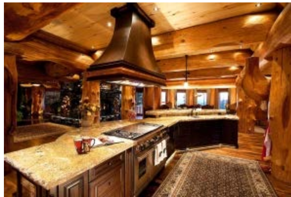
The crew at Pioneer Log Homes creates some of the more interesting log cabins.

The cedar rocket — as they call it — could possibly be the only wooden car in the world and is gunning for the title of the fastest log car in the world.