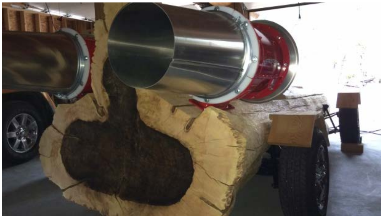
First look at a car made out of a single piece of log (Bryan Reid Sr.)

By Daybreak Kamloops, CBC News | Posted: Oct 22, 2015 7:00 PM PT | Last Updated: Oct 22, 2015 7:00 PM PT